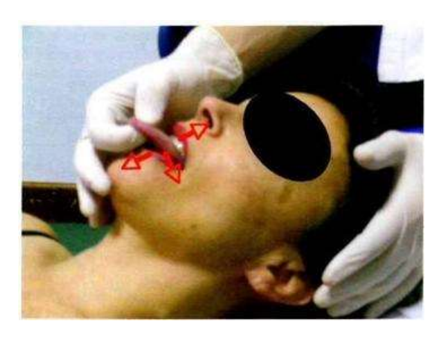
Fig. 2: Tongue testing and treatment played in global non-compensated muscular stretching posture. The arrows indicate the directions of stretching performed after having properly massaged the tonge. The neck and the column should be strictly in global decompensated posture and breathing has to be diaphragmatic.

After this analysis, I started working to rebalance muscular tensions on the patient in decompensated posture. In this specific posture, muscular chain of neck, back, lower back, legs, is in delicate stretched tension. After explaining the release of the diaphragm breathing, I began to treat her tongue by running a real massage and stretching the tongue, a little annoying work but quite interesting. It was amazing to observe the difference in mobility of the tongue: on one side free to move properly, on the other absolutely rigid and braking, with so limited movement that it could not do even those elementary movements that anyone can do.