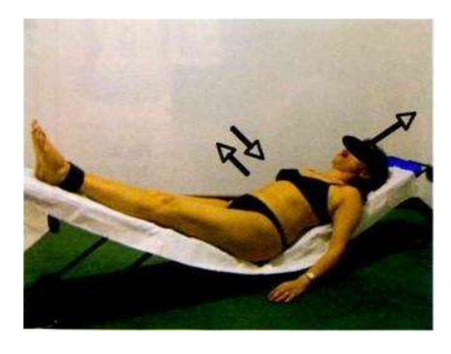
Fig.1: Example of correct breathing in a basic posture of global non-compensated muscular stretching. The pretension of the posterior chain that is created in this position allows making extremely effective diaphragmatic breathing, indicated by the arrows.

Looking at the teeth, there were large and bulky amalgam (alloy of lead and mercury, etc.) on all molars and premolars. Performing a test on the tongue, it was discovered that it could move easily from only one side of the mouth but could not get to the opposite side. In fact, the patient confirmed that she could chew in one side only, right from the side in which her tongue was free to move.