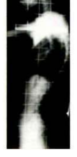
Fig.1 X-ray of a hunched back. It appears clear the increase of the thoracic kyphosis and the depth of the two lordosis, cervical and lumbar.

Over time, everybody naturally tends to stiffen and hunch as an effect to the muscular tensions acting on the joints modifying their connections. The main cause has to be found in our lifestyle and culture that does not consider acting in advance against pollution, wrong diets, etc.